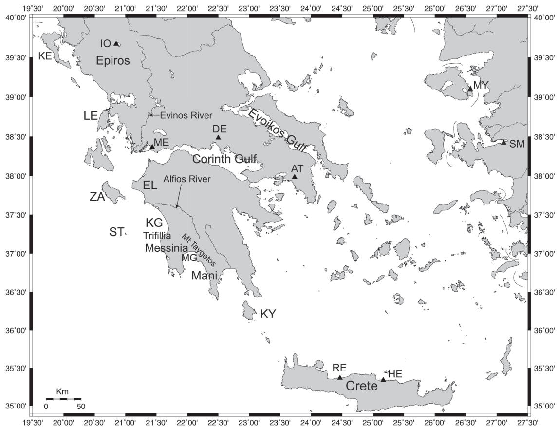
Fig. 1 - Orientation map for Peloponnese and the surrounding areas. Key: AT = Athens, DE = Delphi, EL = Elis, HE = Heraklion, KE = Kerkyra (Corfu), KG = Kyparissiakos Gulf, KY = Kythira, LE = Lefkas, ME = Messolonghi, MG = Messiniakos Gulf, MY = Mytilene, IO = Ioannina, RE = Rethymnon, SM = Smyrna, ST = Strofades, ZA = Zakynthos.