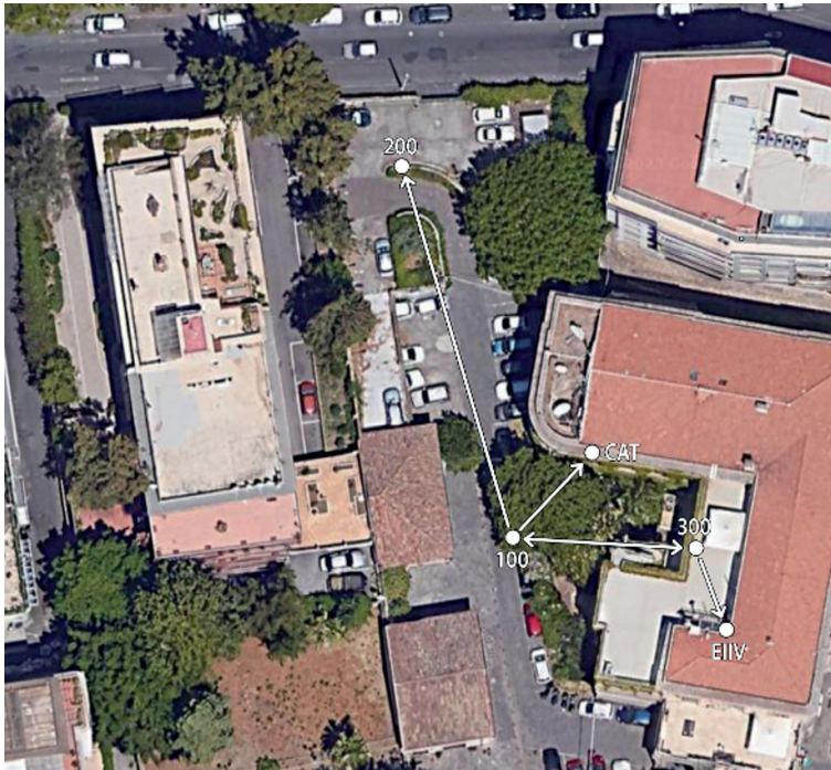
Fig. 4 - The survey scheme of the INGv-Catania GO station (CAT), EIV is the permanent GNSS station; 100, 200 and 300 are the auxiliary points to measure the coordinates of the gravity station.