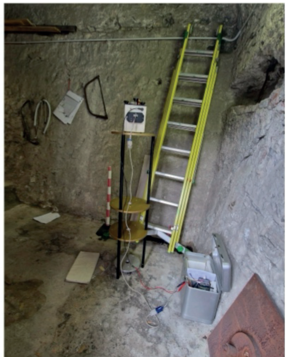
Gravity gradient observations.