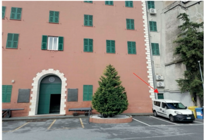
Absolute gravity observations.