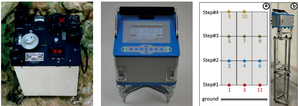
Fig. 3 - The relative gravimeters used in the frame of the project: LaCoste & Romberg, model D (left); Scintrex CG-6 (middle) both employed to measure the VGG and the gravity difference from the absolute to the auxiliary outdoor point; example of measurement scheme and tripod frame employed to measure the VGG at the absolute stations (right).

For most gravity stations, the surveying scheme that has been adopted for referencing the GO points is based on the integration of GNSS observations and three-dimensional (3D) total station local survey. Outside each GO station, a GNSS campaign, was performed on at least two points. Starting from these GNSS points, 3D closed loop traverse schemes were, then, adopted to survey the GO points located inside buildings. In particular sites (for example Catania, Noto, Palermo, and Rome), GNSS permanent stations were included in the traverse scheme in order to improve the robustness of the surveys.