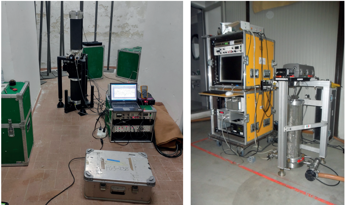
Fig. 2 - The absolute ballistic gravimeters used in the frame of the project: FG5#238 (on the left) and IMGC-02 (on the right).

accurate time reference for measuring the time of free-fall, whereas the IMGC-02 gravimeter is based on laser interferometry to measure the symmetrical free rising and falling motion of a test mass in the gravity field. The IMGC-02 serves as the national reference of absolute gravimeters.