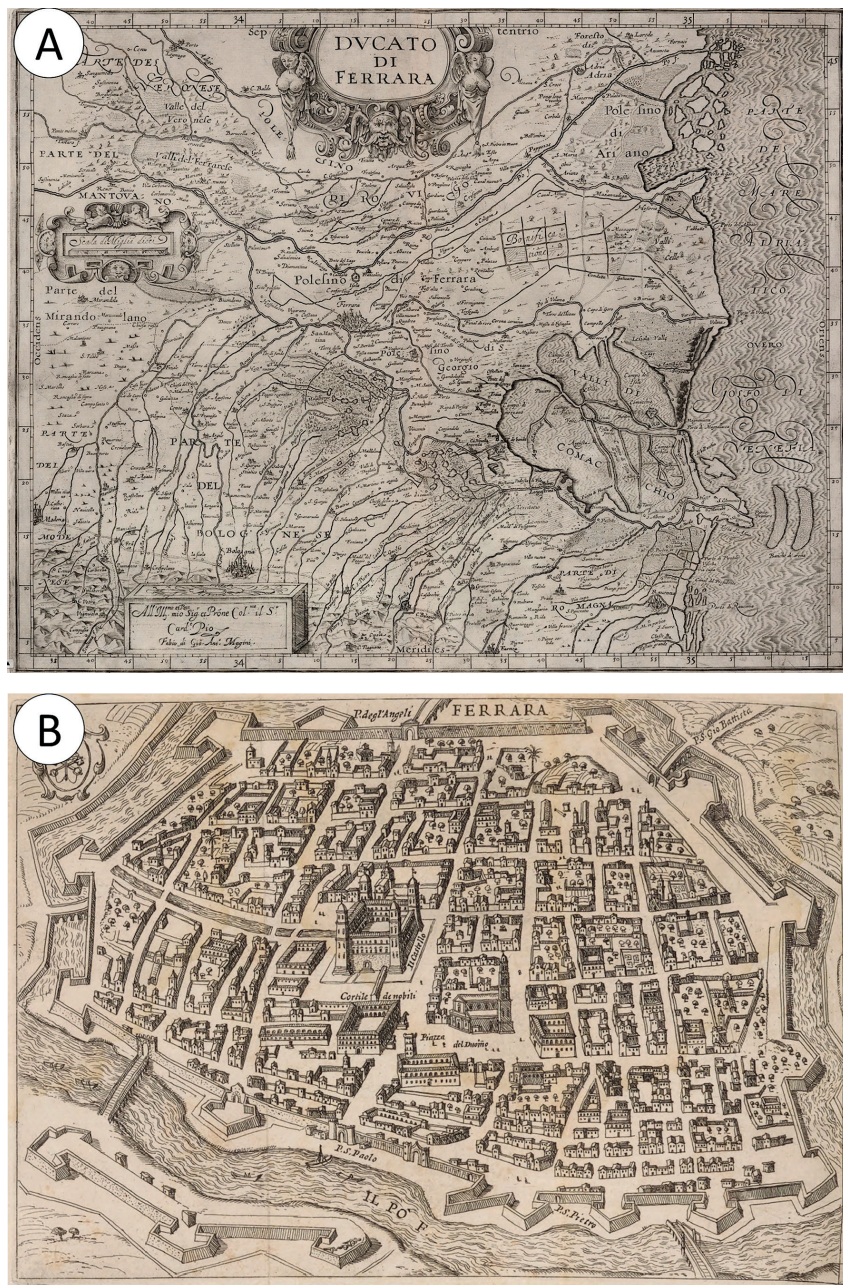
Fig. 3 - A) The Duchy of Ferrara (Magini, 1620); David Rumsey Map Collection, David Rumsey Map Center, Stanford Libraries; B) a bird's-eye view of the town of Ferrara (Scoto, 1665); Google Books.