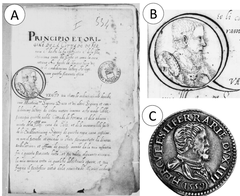
Fig. 4 - Frontispiece (A) of MS classe I, 534 of the BCAFé (Giacomo da Marano, 16 th century_g); detail of the capital letter Q (B) from the above: inserted portrait representing Ercole II d’Este, duke of Ferrara, as indicated by a comparison with a 1559 coin (C) bearing the duke’s effigy (private collection).

This MS is very important because it is the final version of the work, it bears the original title chosen by the author and, finally, because it summarises all we know about its author, expressed in his own words. In the dedication preface to the text, Giacomo da Marano himself explains that